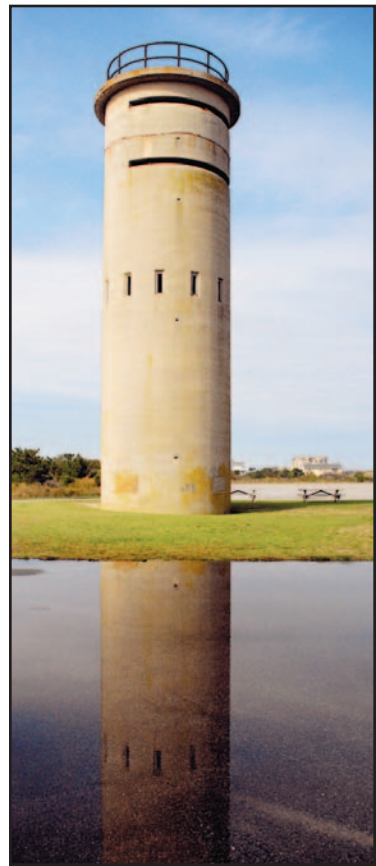
At right, Tower 3 in Dewey Beach is reflected in a pool of water. The tower is scheduled for restoration that will allow it to open to the public.